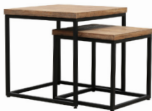
SIDE NEST OF TABLES