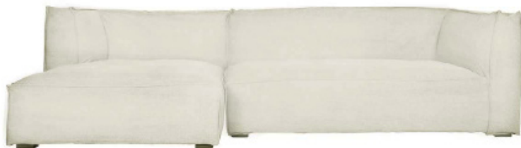
2.5 SEATER + CHAISE 300w 130d 80h