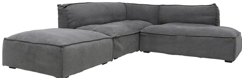
CORNER MODULAR 283w 247d 78h