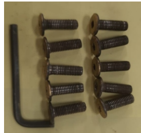
Allen bolt and spanner

Place the cabinet inverted on a clean surface. Align the metal feet holes with that on the cabinet and screw with the help of allen bolts provided