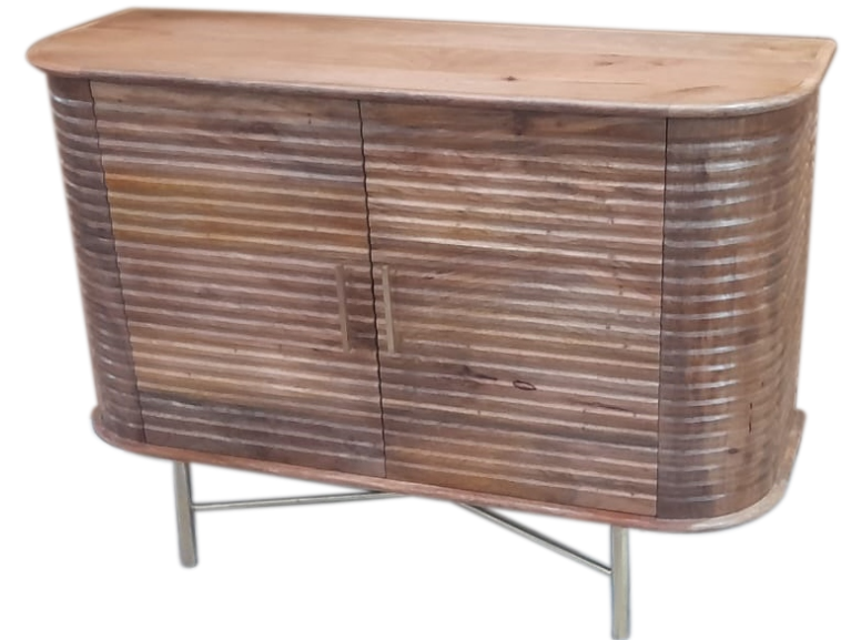
Final Assembled product