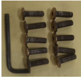
Allen bolt and spanner

Place the cabinet inverted on a clean surface. Align the metal feet holes with that on the cabinet and screw with the help of allen bolts provided