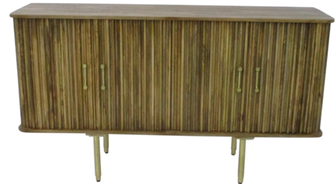
Final Assembled product