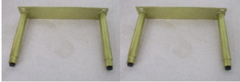
2 pcs metal feet